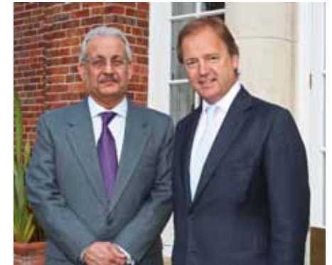
Hon. Senator Rabbani meets Rt Hon. Hugo Swire MP

CPA UK, in cooperation with BHC Islamabad, hosted a delegation of nine Members from the Implementation Commission of the Parliament of Pakistan, 4-8 July 2011. The aim of the visit was to discuss the successes, weaknesses and ongoing challenges of devolution in the UK and was timed to coincide with the introduction of Amendment 18 to the