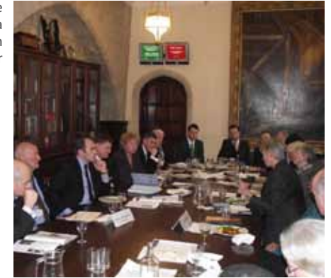
Delegates from the Isle of Man on a study programme in Westminster