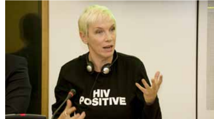
Annie Lennox OBE addresses delegates on World AIDS Day

The programme for CPC 2011 was two days shorter than in previous years. The days spent on cultural activities were omitted as an unnecessary expense given the economic climate and the need to drive down costs. With this saving and a strict adherence to other economies, the final out-turn of the conference to CPA UK and the Houses of Parliament was £890,311.90, a reduction of £736,925.13 on the original budget of £1,627,237.03.