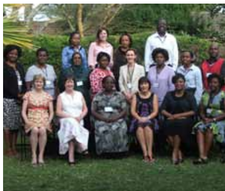
UK delegation attends KEWOPA seminar in Kenya

As part of a broader country programme run by The Westminster Consortium (TWC), of which CPA UK is a partner, CPA UK ran a two-day parliamentary seminar for Mozambican Parliamentarians in Maputo in early October. The seminar,