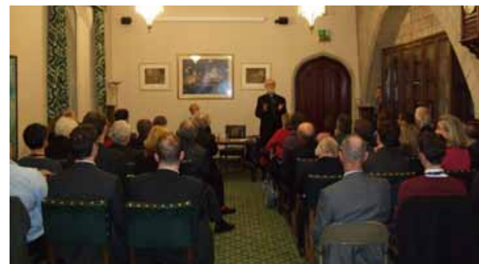
The Archbishop of Canterbury addresses assembled parliamentarians