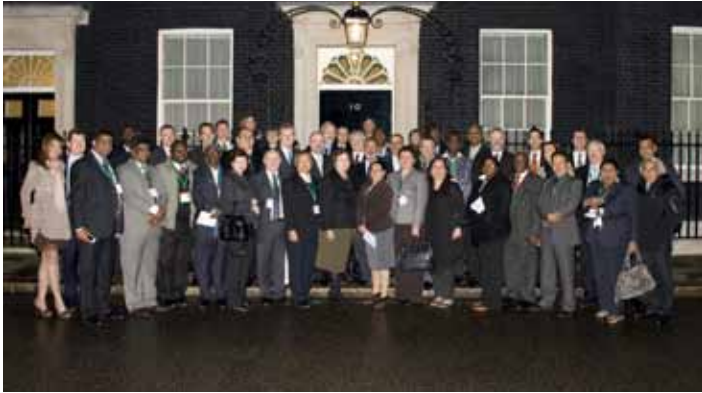
Westminster Seminar delegates assemble outside No. 10 Downing Street