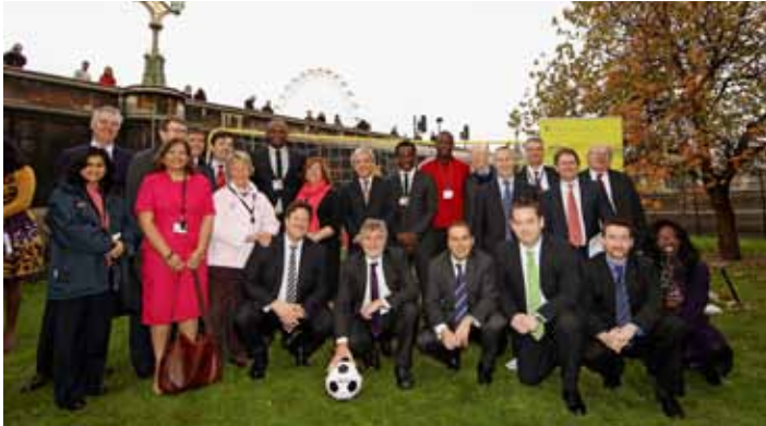
Parliamentarians and footballers come together to eradicate poverty