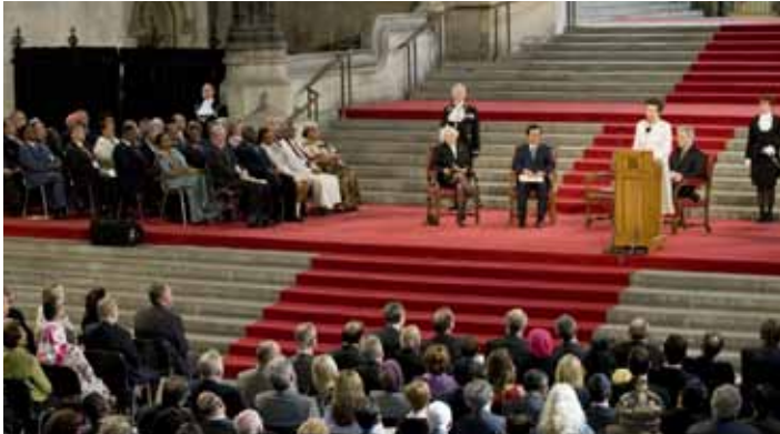
HRH The Princess Royal addresses the Opening Ceremony of CPC 2011