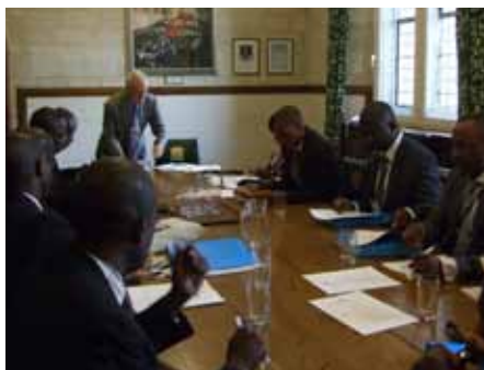
Clerks from Sierra Leone attend a study programme in Westminster

From 8-16 September 2011, eleven Committee Clerks from the Parliament of Sierra Leone attended a Level 1 capacity building programme in Westminster. Highly interactive, the programme was designed to build the Clerks' capacity to effectively administer their committees in Sierra Leone's post-conflict Parliament through gaining an understanding of the