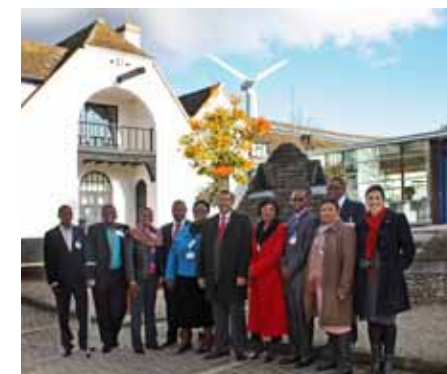
South African climate change delegation visits wind farm in Scotland

CPA UK ran a programme for the South African Parliament's Steering