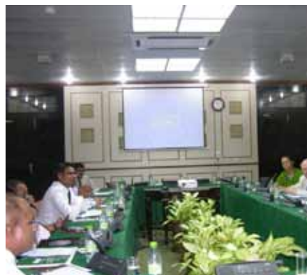
UK parliamentarians run a capacity-building programme in the Maldives Majlis

Whilst in Parliament, the delegation met with Ministers from the Cabinet and Foreign and Commonwealth Offices plus representatives from Electoral Reform International Services (ERIS) and the Boundary Commission of the United Kingdom. They also took part in CPA UK's open forum with Hon. Andrew Scheer MP, Speaker of the Canadian House of Commons.