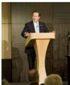
Rt Hon. William Hague MP, Secretary of State for International Development, Rt Hon. Andrew Mitchell MP and the Minister for the

CPA UK and the Houses of Parliament hosted the annual Commonwealth Parliamentary Conference (CPC) 21-27 July 2011; the year that marked the 100th anniversary of the original Association. The conference theme, 'Reinforcing Democracy,' explored in a full and engaging programme that featured plenary addresses from HRH The Princess Royal (representing the CPA's Patron, HM The Queen), Prime Minister Rt Hon. David Cameron MP, Secretary of State for Foreign and Commonwealth Affairs,