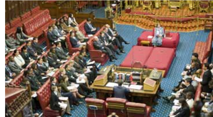
The Lord Speaker presides at the Commonwealth Youth Parliament

Rt Hon. Baroness D'Souza CMG; Shadow Minister for Sport Clive Efford MP; former Minister for Sport Andy Burnham MP; and Baroness Heyhoe-Flint OBE DL, a Director of Wolverhampton Wanderers FC and former Captain of the England women's cricket team.