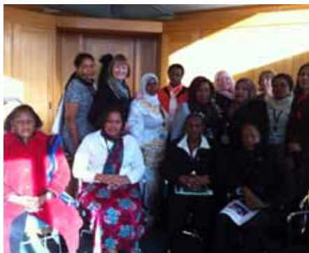
Tanzanian women MPs meet with Rt Hon. Harriet Harman MP