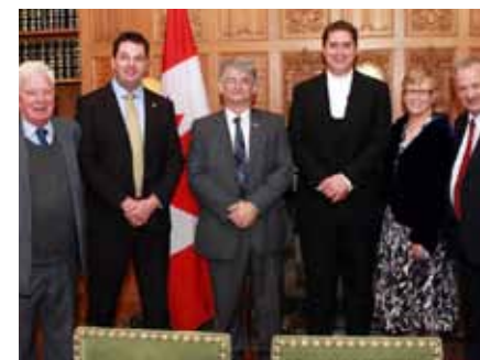
Delegates from the UK meet with Canadian Speaker Hon. Andrew Scheer MP