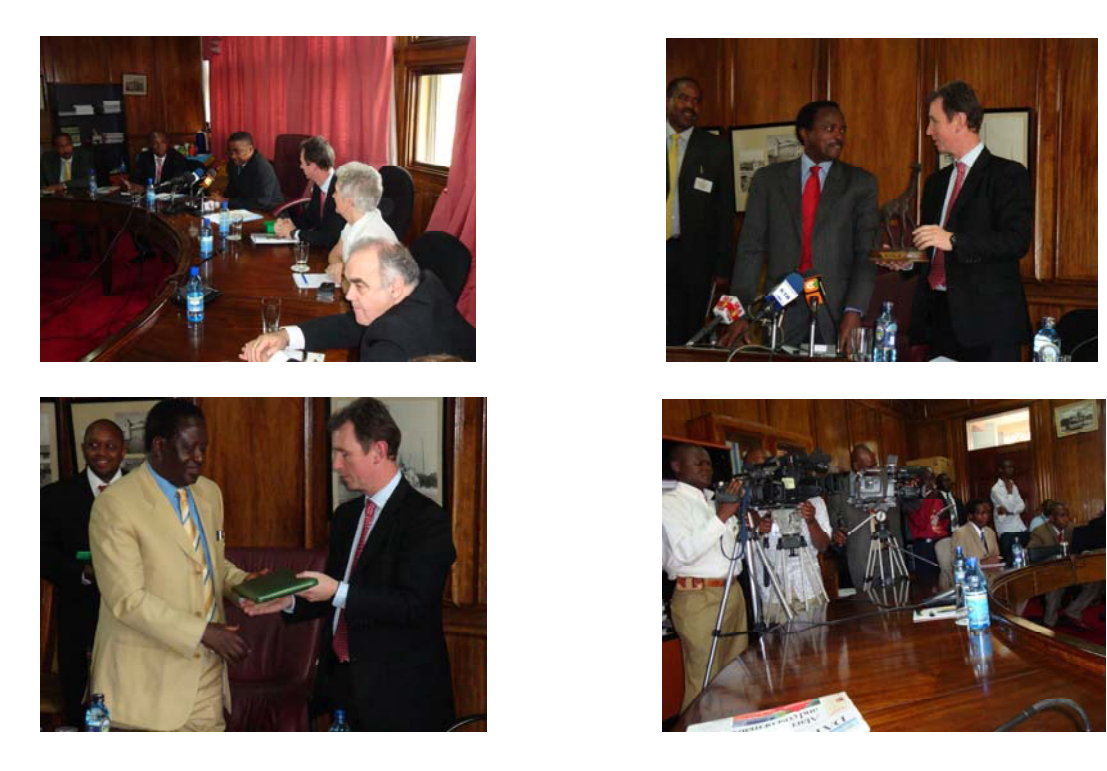
Tuesday 25 November – Meetings with Foreign Minister, Mayor of Nairobi, Press and Media Workshop, Defence and Foreign Affairs Committee; DFID Briefing.