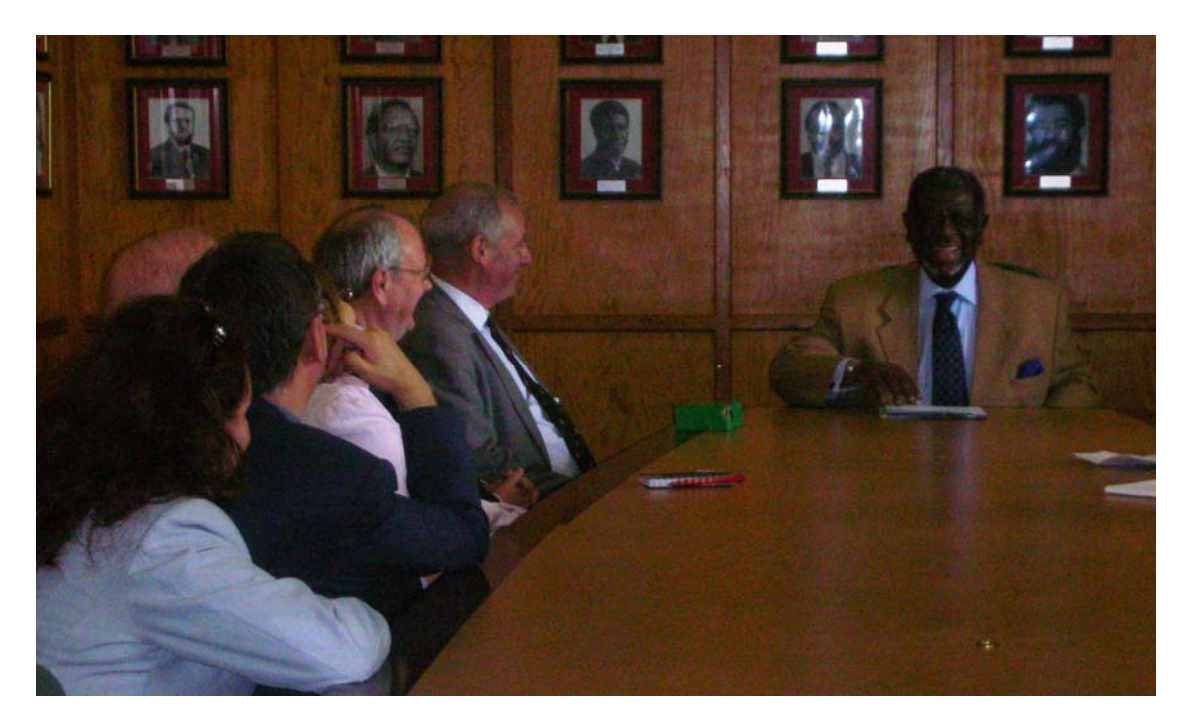
The Delegation meeting with Hon. Dr Theo-Ben Gurirab MP, Speaker of the National Assembly

In November 2009 Namibia will hold presidential and parliamentary elections. The Namibian system is bicameral and consists of the National Assembly (Lower Chamber) and National Council (Upper Chamber). In terms of local governance, Namibia has 13 regions and each has a Regional Council which is responsible for the 'development and administration' of the region. These councils consist of between 6 and 12 councillors who are elected under a constituency system. The Councils elect a Governor from amongst themselves to lead the Council.