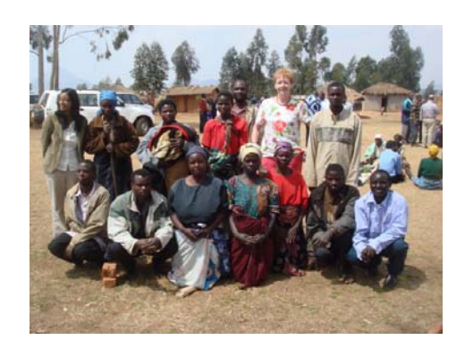
Figures 9 & 10. At a village micro-credit scheme.