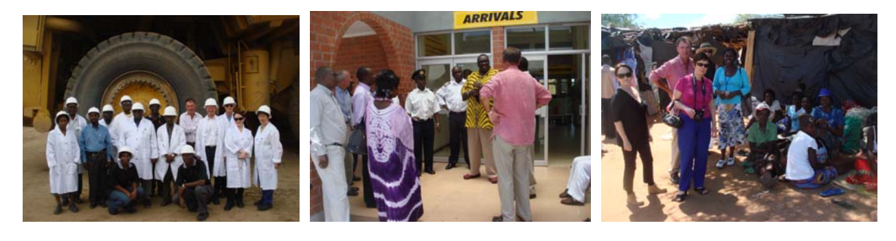
Figure 5. in the Copperbelt. 7. With Zimbabwean Women at Chirundu.

Figure 6. At the One Stop Border Post. Figure