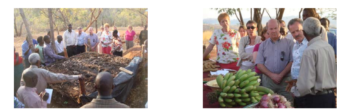
Figures 11 & 12. At Lipangwe Organic Demonstration Farm (Self-Help Africa).