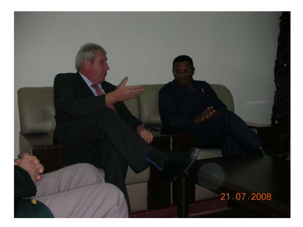
Meeting with the Minister for Foreign Affairs, Mr Bernard Kamillius Membe MP

During the visit the delegates met with the Minister for Foreign Affairs, Mr Bernard Kamillius Membe MP who discussed at length Tanzania's role in promoting peace at a regional level, specifically referring to Zimbabwe, Sudan and Burundi. On Zimbabwe, Mr Membe indicated that the biggest challenge for SADC is to stop sanctions being placed on Zimbabwe as the best path is to get maximum cooperation from the parties. The credibility of SADC, AU and Zimbabwe depends on whether they can strike a deal and keep to it. In SADC and elsewhere there are extreme views both for and against Mugabe, for example, the Democratic Republic of Congo is supportive of him. SADC itself has cracks but it does come together, while the AU itself is united in its desire to have a Government of National Unity in place in Zimbabwe as a transitional measure until elections.