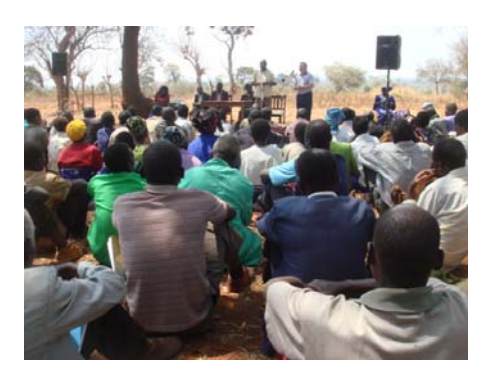
Figure 13. At Khongoni Traditional Authority. Trade Unions.

Visit to a Traditional Authority Khongoni, SADCOPAC conference, the MCTU and Benny's Hope Women and Children's Foundation of Canada School. Reception at British High Commission.