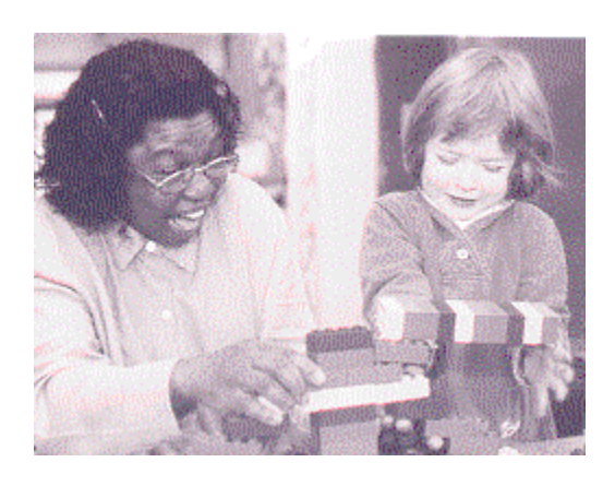
FIGURE 4 ADULTS PLAY AN IMPORTANT ROLE IN DEVELOPMENT