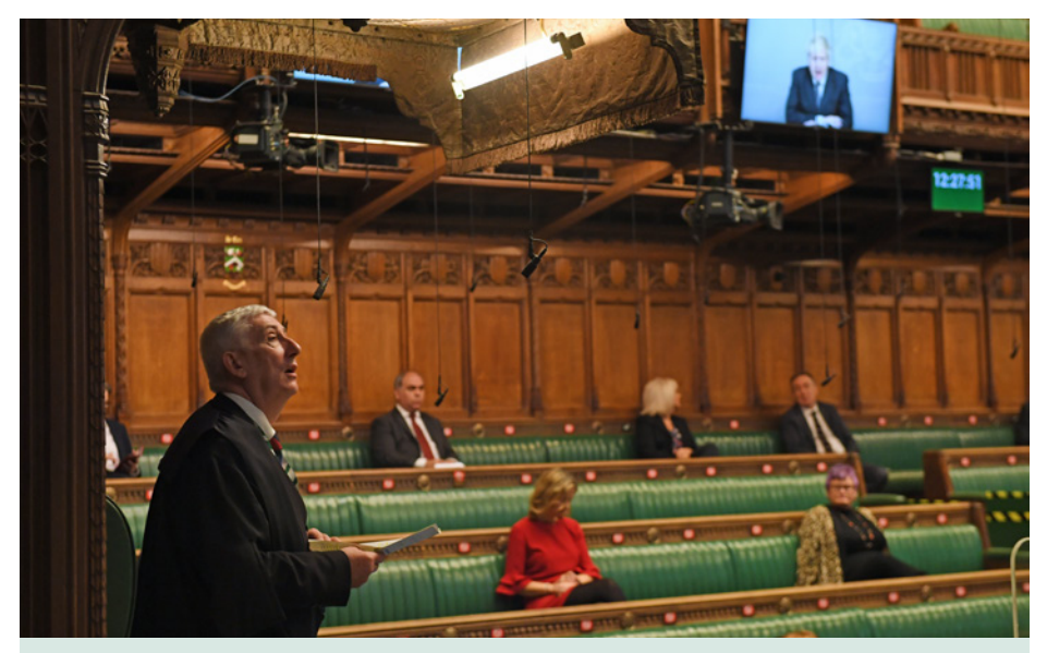
Colleagues from across the House rose to the challenge to ensure the House could continue to function.

The onset of the pandemic not only overturned a way of working that has kept the House of Commons functioning for more than 700 years – but in many ways, it forced the organisation to become more resilient.