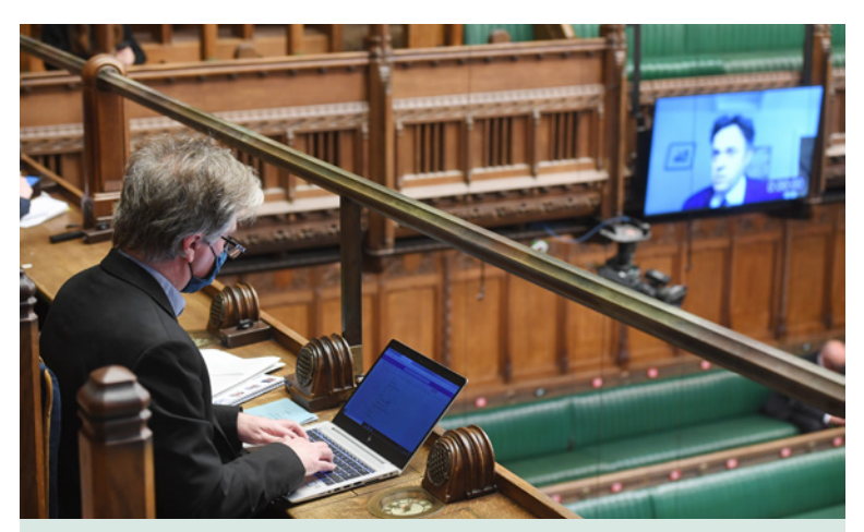
Hansard reporters continued to operate throughout the pandemic, ensuring the business of Parliament was recorded for the outside world.

PDS also developed a remote equivalent to the annunciators so that Members and the public could keep in touch, see progress of business, and be notified when Divisions were taking place. Launched in the early summer of 2020, ParliamentNow is available as an Android and an Apple IoS app and via the web.