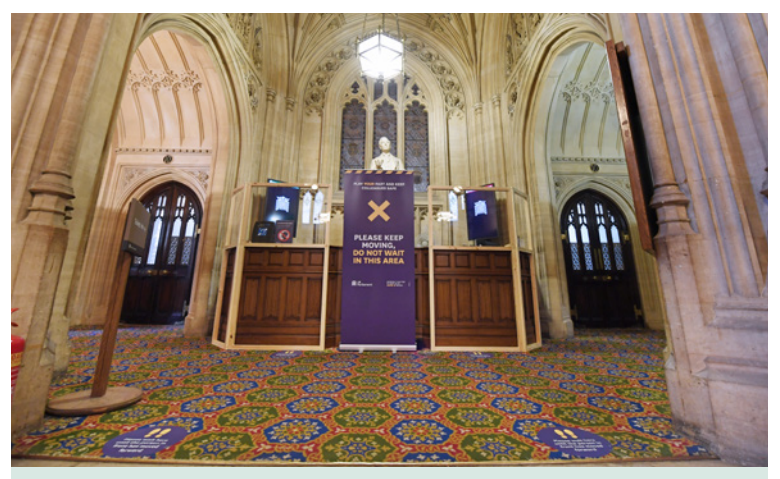
A range of signs were put up across the parliamentary estate to ensure social distancing could be maintained.

To ensure the safety of all those who had to be on the Estate, on 16 March the Speaker announced a ban on virtually all external visitors to the Estate.