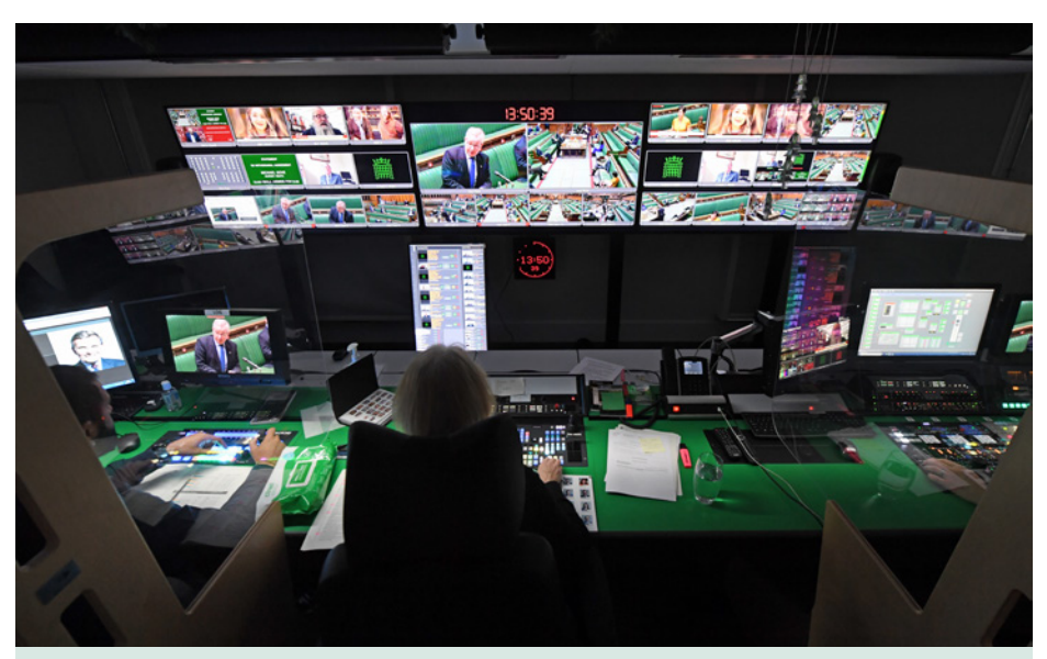
The development of virtual participation took place alongside the opening of a brand new control centre for Parliament's broadcasting unit.

As the Covid-19 pandemic took hold, Parliament's digital team (PDS) launched a major project of works to manage the transition to safe and effective home working. To enable Members and staff to work productively when not on the Estate, PDS took the decision to rollout out Microsoft Teams, and in just over four weeks, more than 9,000 Parliamentary users had been migrated to the new tool.