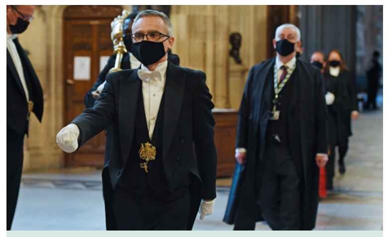
The daily Speaker's procession also had to adapt to the pandemic.

The Speaker undertakes a number of ceremonial duties, one of the most high-profile being the daily Speaker's procession where the Mace is carried into the Chamber ahead of each sitting day. This procession, featuring Mr Speaker, the Speaker's Chaplain, Speaker's Secretary, Speaker's Trainbearer and Serjeant-at-Arms, was made single file, and with all participants wearing masks.