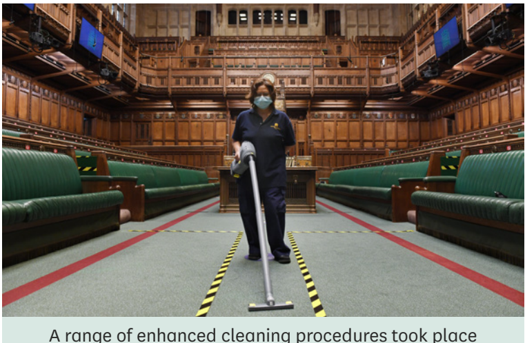
A range of enhanced cleaning procedures took place to ensure Parliament remained Covid-secure.

Behind the scenes, there is a hard-working army of In-House Services and Estates staff who keep the Houses of Parliament running, so that the work of both Houses can continue without disruption. These include cleaners, caterers, security officers, project delivery specialists, those in charge of fire safety, visitor assistants, heritage teams and office managers.