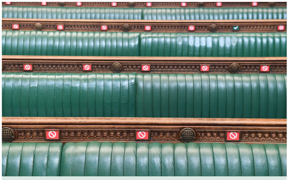
Signs clearly showed where MPs could – and could not – sit on the Commons' green benches.

The atmosphere across the wider Estate changed too. From the corridors and lobbies to the cafes and restaurants – once bustling with MPs, staff, visitors and journalists, the pandemic meant they were almost deserted. The majority of House staff moved to working from home, and many MPs contributed to Parliamentary proceedings remotely by video-link.