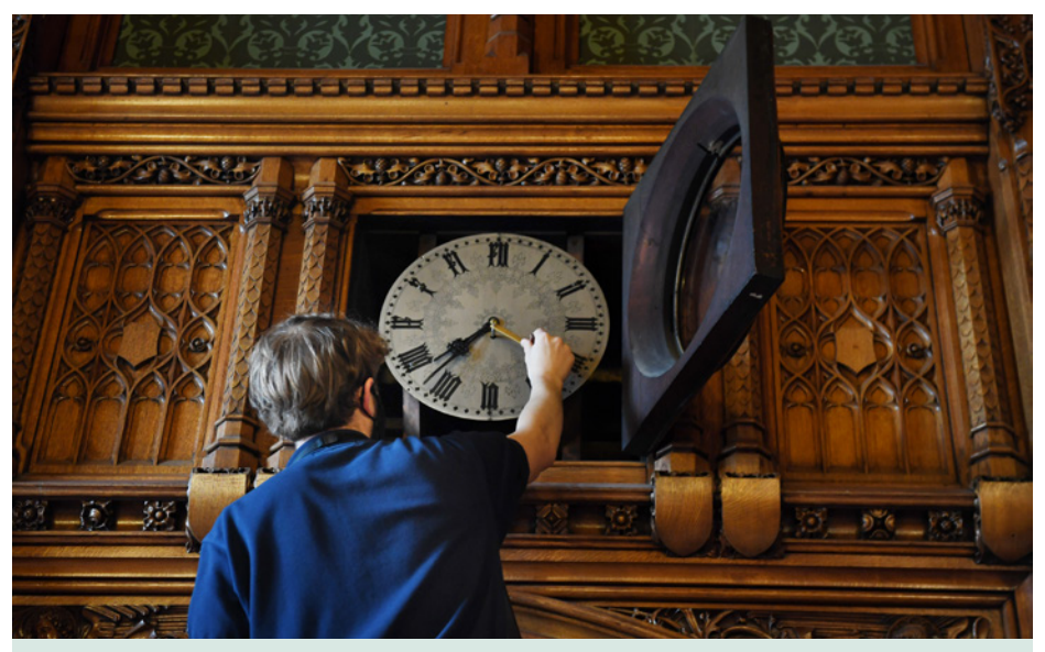
Parliament's range of skilled mechanics and engineers ensured vital work behind the scenes could continue.

The catering team continued to serve food and drink for essential workers on the Parliamentary Estate, in a Covid-secure way. This involved major changes, such as recruiting marshals at queuing points, spacing out tables and chairs, regular sanitising as well as more detailed tweaks such as removing items like cutlery and condiments and using disposable alternatives. The team had to become as flexible and adaptable as possible, while introducing innovations such as a new take-away service from one of the restaurants and transforming a traditional dining room for Members into a caféteria.