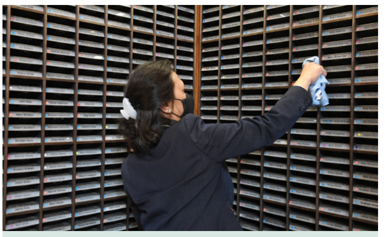
Cleaning teams ensured the Members' message boards were cleaned as part of the work to ensure Parliament could run as safely and efficiently as possible.

During the last year, the Project Delivery team worked tirelessly to ensure that improvement works to the Palace and new accommodation for all House staff continued in a Covid-secure way while minimising the impact on the operation of Parliament. These works include the completion of the encaustic tiles project, the cast iron roofs project, Elizabeth Tower restoration and conservation project, the fit out of 64 Victoria Street, the refurbishment of Derby Gate, completion of the fire protection programme and many more projects essential to the continuation of the operation of the Estate. The team were supported by many colleagues including architects, engineers and other design and technical specialists.