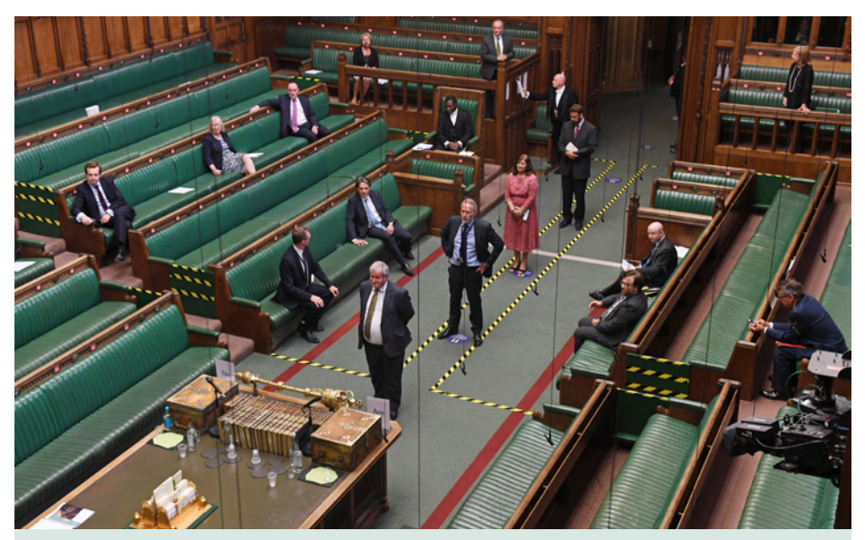
For a while during the pandemic a socially-distanced queueing system was used for voting purposes.

administration to manage question sessions efficiently and effectively. The first virtual questions session was with the Secretary of State for Wales, followed by a historic first ever virtual PMQs, on 22 April 2020. Despite a few all-too-relatable technical glitches – from Members on mute to WIFI dropouts – the adaptation was a huge success, and ensured effective scrutiny could continue remotely. From June 2020 until December 2020 hybrid participation covered questions, urgent questions and ministerial statements, before being rolled out to most other types of Chamber procedure following a motion passed by the House on 30th December 2020.