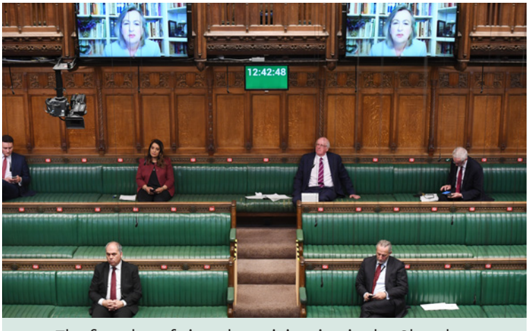
The first day of virtual participation in the Chamber took place on 22 April 2020.

Members and the Speaker in the Chamber. New support roles were quickly invented and recruited from volunteers right across the House service to ensure the smooth running of this new procedure.