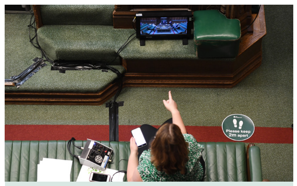
The Speaker's Secretary and assistants were given headsets to keep in touch with the virtual Chamber control centre.

Throughout the course of the day there were regular suspensions of around three minutes between items of business to ensure the safe movement of Members in and out of the Chamber, and to allow the historic Despatch boxes to be carefully cleaned. Viewers of the Chamber also noticed that Perspex screens had been installed around the seats of the Speaker, Serjeant-at-Arms, Clerks and Speaker's Secretary. The Speaker's Secretary no longer stood beside the Speaker, and sat on the Bench (in a seat historically used by the opposition whips), with a headset on, to keep in constant touch with the virtual Chamber control centre to ensure the smooth running of virtual participation, and to keep the Speaker abreast of any last minute changes to participation.