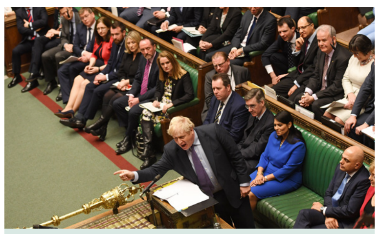
The House of Commons at full, lively, capacity, just weeks before the country was plunged into lockdown.

The House of Commons is at the very heart of the country's political and democratic life. It is far more than just a collection of buildings – it is a living, breathing, vibrant community where decisions are made that impact upon the whole nation. Colleagues in all areas of work, from procedural experts to caterers, from mechanics to politicians plays a key role to ensure it functions. At its peak there can be well over 3,000 people in and around the Estate at any one time.