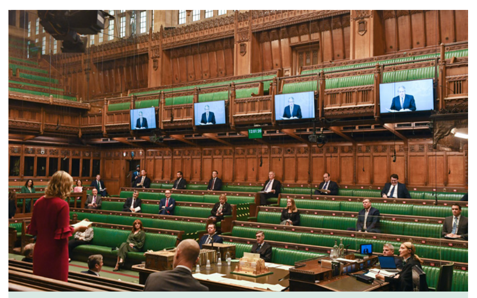
Video screens were installed in the Chamber to ensure Members could participate remotely.

On the evening of 30 March 2020, as a result of the pandemic, the Parliamentary Broadcasting Unit was asked if it could support hybrid sittings in the House of Commons Chamber. This was a daunting challenge for the unit, which is normally responsible for live televised coverage of Chambers and committees in both Houses, made available to BBC Parliament and other media organisations, as well as Parliament's online video service, <u>parliamentlive.tv</u>.